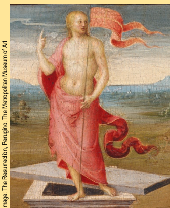
Image: The Resurrection, Perugino, The Metropolitan Museum of Art